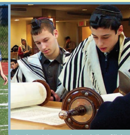
Students join together in daily tefillah , encouraging the development of both the skill and the kavanah (attitude) necessary for heartfelt expression.

Maimonides' "M-Cats" athletes compete in interscholastic regular-season and tournament games throughout the state.